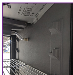
Molded ABS liner with shelf supports