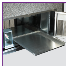
Slide out condensing unit

The drop-in air curtain merchandiser include a night security cover.