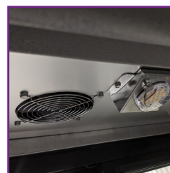
Top mount coil & LED light