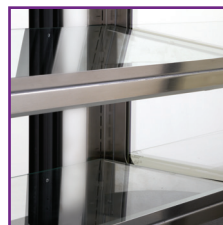
3 adjustable glass shelves