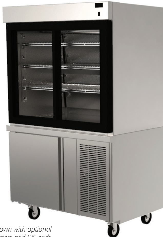
Shown with optional casters and S/S ends.

The molded stain resistant ABS interior provides the strength to withstand hard use and unintentional abuse year after year. We guarantee the ABS liner against cracking, denting or corrosion under normal use conditions.