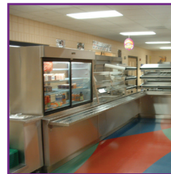
Variety to fit into your operation