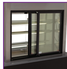
Rear loading doors