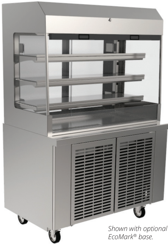
Shown with optional EcoMark® base.

Sliding, locking doors provide easy access for loading product from the back - perfect for units built into a serving line.