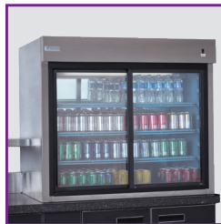
Self closing sliding doors

Many times, aesthetics do matter. Choose a laminate or graphic package that ties into the room décor and upgrade the already great looking stainless steel exterior.